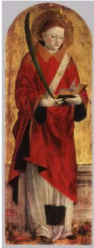
SAINT STEPHEN DEACON & MARTYR